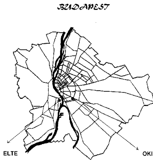
Figure 1. Sampling locations in Budapest